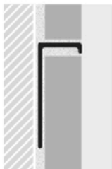
As a listello