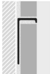
As a listello