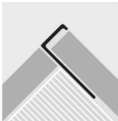
As a corner guard