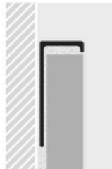
As a wall corner trim